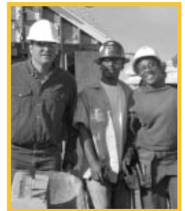
Century's workers shown at training site.

Shortly after opening its doors, the training program partnered with