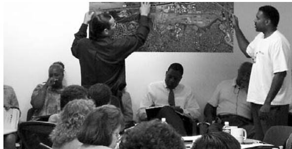
Community representatives join PVJOBS at recent Collaborators Meeting.

Thousands of potential employment opportunities were introduced when 60 job placement counselors from local community-based organizations attended the PVJOBS Collaborators Meeting recently held at Playa Vista. The job placement counselors, who all represent organizations that partner with PVJOBS, attended the meeting to learn about new career opportunities offered through PVJOBS+, an expanded employment program that