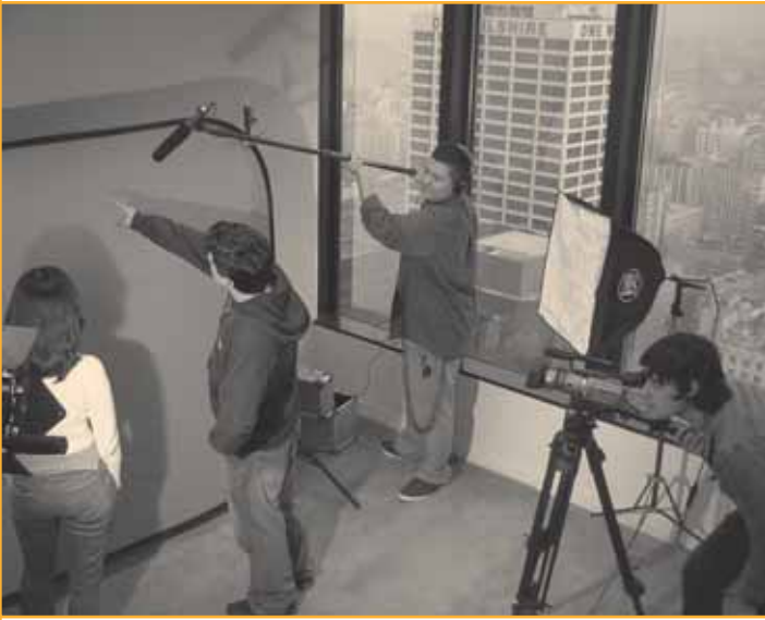
e7 Interns work on producing an animation design segment.

crafts. Only three awards of its kind were granted nationally, which is indicative of the Department's faith in PVJOBS.